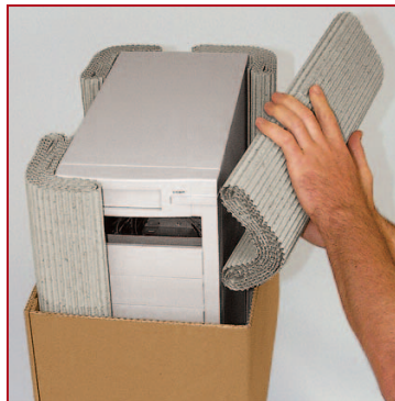
Soft wrap offers reliable edge protection.