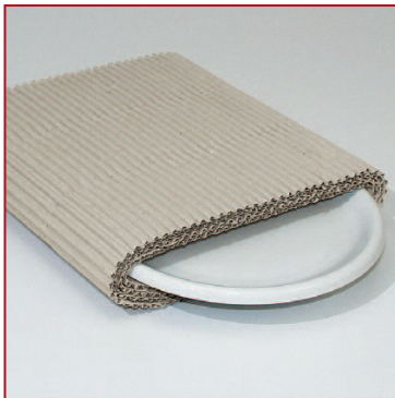
Soft wrap protects sensitive packaged products.