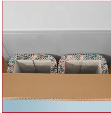
To inexpensively bridge cavities.