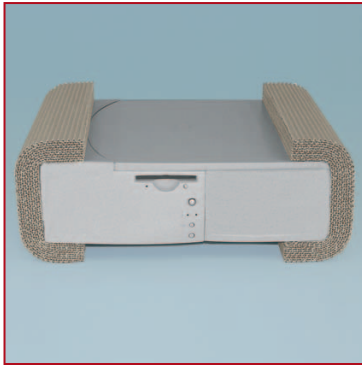
To protect square packaged products.