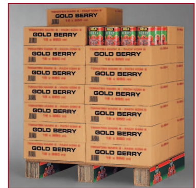
Low weight with high load-bearing capability – these are the advantages of the romwell pallet skids.