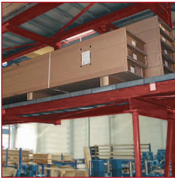
Heavy goods for international shipment are stored here.