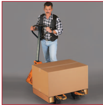
The pallet box or the pallet can be easily moved with a fork-lift truck or industrial truck.